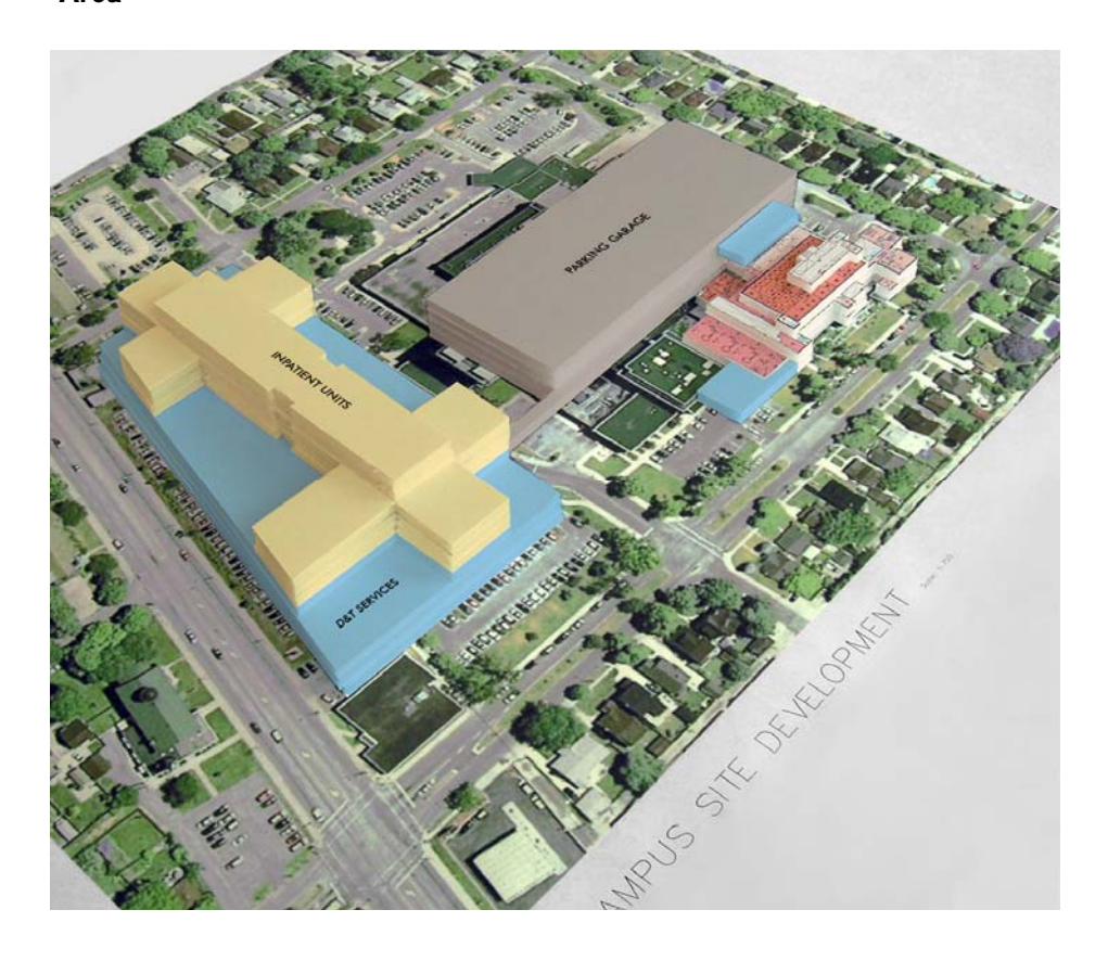
Option 2: Replacement of Current Facility in the Existing Main Parking Area