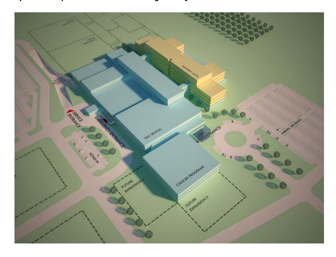
Option 3: Replacement of the Existing Facility on a New "Greenfield" Site

This option will create a new state-of-the-art facility. Side-by-side inpatient units can be created for operational efficiency, but, due to planning constraints, it is difficult to "pair" the units to create swing beds. Some expansion potential is available on site, although the geometry (L-shaped) is not ideal. Construction on the north side of the site will have limited impact on residential neighbours. The most severe constraint appears to be the lack of parking on site during construction.